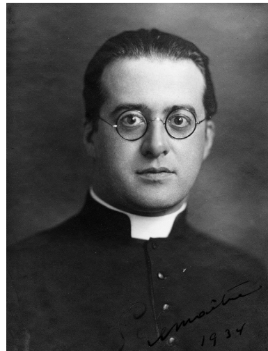
Figure 1 — Mgr. George Lemaître.

Georges Lemaître gave a theoretical proof, for his 1927 doctoral thesis in astronomy, that the “maximum spherical radius” of our Universe can be computed from first principles to be 14.2 billion light-years (Lemaître 1927a). That estimate, which is known as Lemaître’s limit, is based on Lemaître’s dynamic-equilibrium theory of the Universe. It is surprisingly close to current estimates of the Universe’s age. That age has been firmly established at approximately 14 billion years, based on multiple measurements, including measurements of the extragalactic distance scale by the NASA Hubble Space Telescope Key Project (Freedman et al. 2001), and of the cosmic microwave background radiation by the NASA Wilkinson Microwave Anisotropy Probe in combination with measurements of the distribution of galaxies by the Sloan Digital Sky Survey (Tegmark et al. 2004). Recently released final results from the full nine years of measurements by the Wilkinson Microwave Anisotropy Probe put the Universe’s age at 13.74 \pm 0.11 billion years (Bennett et al. 2013).